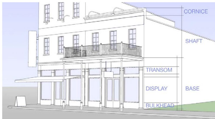
Figure A-10.1 Shopfront Elevation Elements

Cornice: Trim required at the eave or top of parapet. May include one or more habitable floors for buildings over 6 stories.