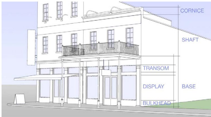
Figure A-10.1 Shopfront Elevation Elements

Cornice: Trim required at the eave or top of parapet. May include one or more habitable floors for buildings over 6 stories.