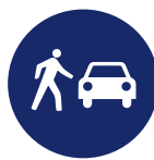
Mobility and Connectivity