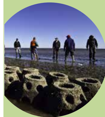
Volunteers construct oyster reefs along Mobile Bay as part of the RESTORE Act grants.