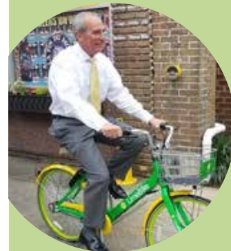
Mayor Stimpson tries out LimeBike dockless bikeshare service.