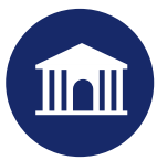
City Facilities and Services