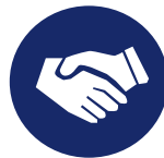
Collaboration and Cooperation