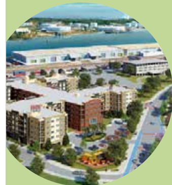
The recently approved Meridian at the Port development is expected to bring 700 residents Downtown.