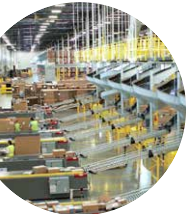
Amazon sortation center opened in 2018.

The City of Mobile and strategic partners have achieved progress in the area of economic development. During 2018, the ribbon was cut at the new Amazon sortation center. The opening of this facility is expected to create hundreds of new jobs for citizens. Additionally, in late 2017, Airbus announced plans to build a second Final Assembly Line at the Mobile Aeroplex at Brookley Field, and SSAB Steel announced plans to move its corporate headquarters to Mobile.